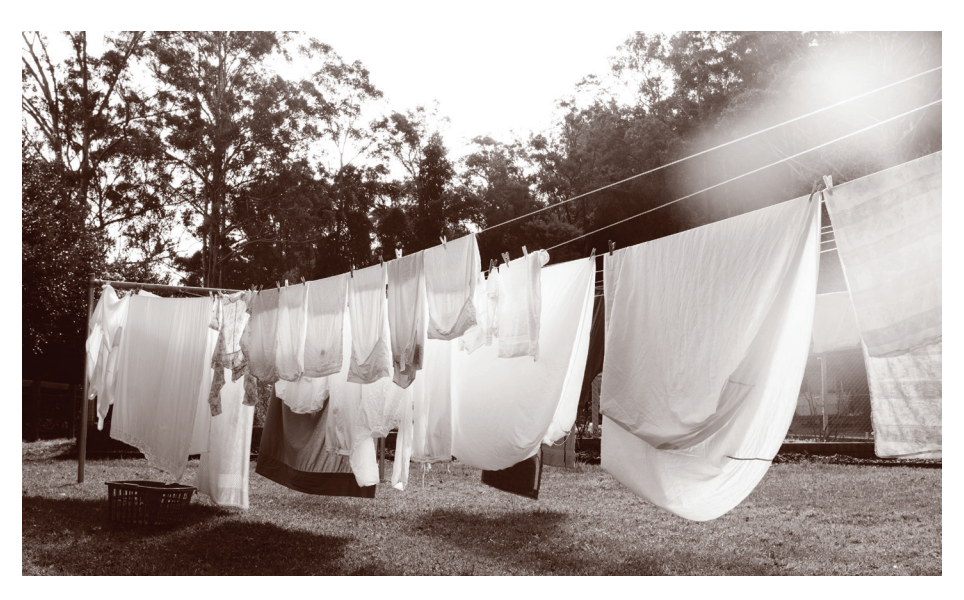
The days of pegging out washing and regularly opening windows are long gone for many people. Excess moisture and poor ventilation are widespread problems in our homes.

Draughts can have a real impact on indoor temperatures and occupant comfort, even in new homes, as not all are performing as well as Figure 1 above suggests. In a Wellington apartment complex finished in 2015, occupants of the double-glazed and insulated units said they were cold. Investigation found poor sealing and draughts were to blame. Fixing sealing strips to doors helped reduce draughts and made the apartments an average 1.4°C warmer.