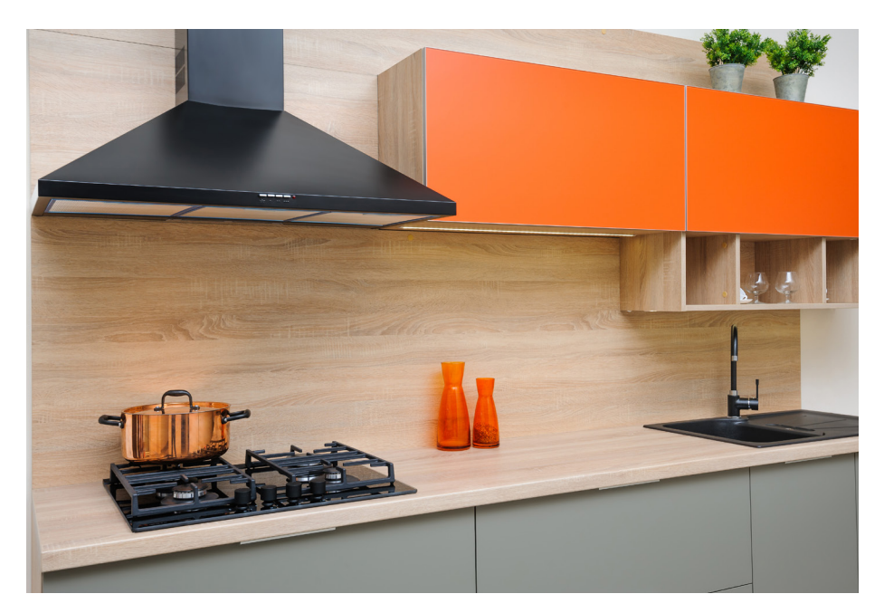
Cooking generates large amounts of moisture and particles that cannot be removed by passive ventilation alone. Kitchens, bathrooms and laundries should have localised extractors to remove moisture at source.

Balanced systems control the airflow both ways. A BRANZ project looked at the performance of a heat recovery ventilation system installed in a test house. Warm outgoing air from inside the house passes through a heat recovery core at the same time as the cold outside air brought in to replace it. While the two air streams never mix, they are close enough for heat to pass from the outgoing air to the incoming air. This reduces the need for additional heating and the energy loss associated with ventilation.